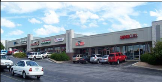
Center Anchors: Price Cutter Plus Area Anchors: U S Bank, Bancorp South, Regions Bank

Building Address: 3250 East Battlefield Road Type of Retail Space: Neighborhood center Year Built: 1993 Total Leasable Square Feet: 27,760 Current Occupancy: 95% Asking Rents by Sq. Foot: $11.00-$12.50 Gross/Net Lease: Modified gross Net Charges: Tenant pays increases