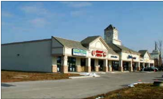
Area Anchors: Sam's Wholesale Club, Kum-n-Go, Reliable Toyota/Lexus, Dairy Queen

Building Address: 3600 East Sunshine Street Type of Retail Space: Neighborhood center Year Built: 2000, 2002 Total Leasable Square Feet: 31,000 Current Occupancy: 90% Asking Rents by Sq. Foot: $13.50 Gross/Net Lease: Net Net Charges: $2.00 Center Anchors: Parlor Eighty-Eight, Snap Fitness